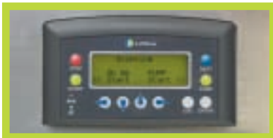
End of process.