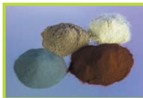
The Spray drying process usually produces a free flowing powder sample.

The Spray Drying process usually produces a free flowing powder sample of a spherical nature and can produce very fast results from a small liquid sample.