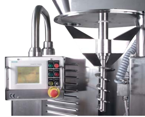
→ Touch panel and feeding screw

The roller compactor then compacts the material into flakes. The feed characteristics of the product are influenced by the surface of the rolls. The retention time of the product within the compaction area is determined by the adjustable speed of the rolls. The necessary compaction pressure is transmitted to the rolls via the hydraulic system. It is infinitely variable within a range. The hydraulic unit keeps the set roll pressure constant, in order to guarantee a homogeneous flake, whilst scrapers keep the rolls clean.