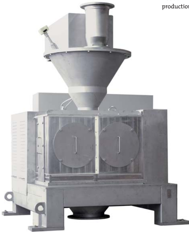
RC 500 production unit