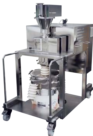
RC 100 Pharma with integrated separator