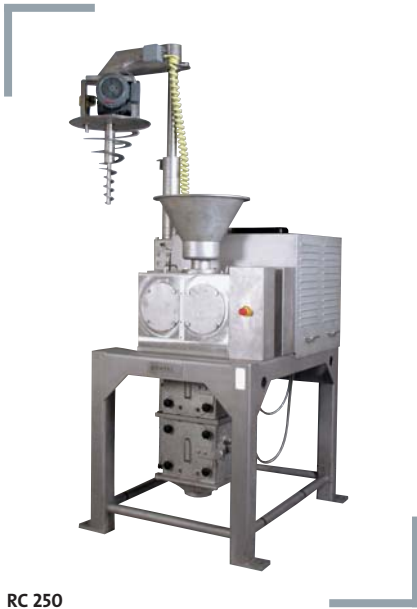
RC 250 with pneumatic lift device and two stage size reduction

Your powder does not flow and cannot be dosed, you have a problem with dust, the solubility is insufficient, segregation occurs or the bulk density is too low? How do your problems with powder and dust disappear? Quite simply: with granules produced by high-performance roller compactors made by Powtec. We offer you a wide range of various roller compactors for particle size enlargement by press-agglomeration of powder and dust. As individual as your demands: From the laboratory machine for processing a few hundred grams right up to the production machine of more than 4.000 kilograms per hour. The application area of this technology is many fold; it ranges from pharmaceuticals to chemical materials or metal powders right up to flavours for food production.