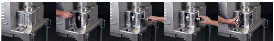
→ roll exchange system

At the beginning of the process the powdery and fine crystalline materials are fed into the compactor hopper. Here, an integrated screw feeder with stirrer secures an even flow of material. Due to it's design, the screw has a pre-compacting and de-aerating effect on the raw material. The vertical screw feeder feeds the product into the nip area of the compacting rolls. The adjustable speed of the screw directly influences the roller gap and therefore the compaction capacity of the roller compactor.